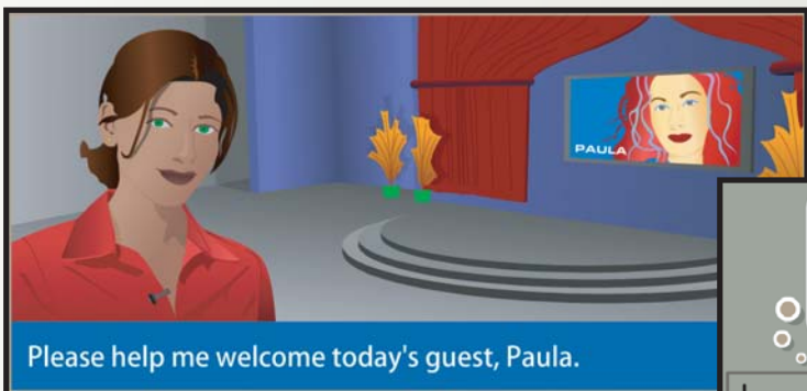
Flash Animation Prolog

SUPPORTED BY THE SHIRLEY AND STEFAN HATOS RESEARCH FOUNDATION